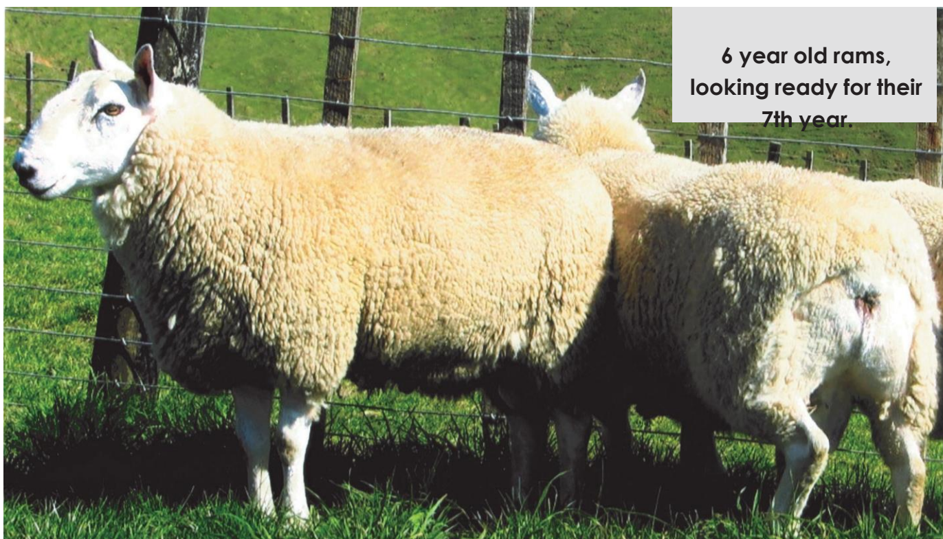
6 year old rams, looking ready for their 7th year.

The neighbours are also now using some of these now redundant Cheviot 6 year old rams.